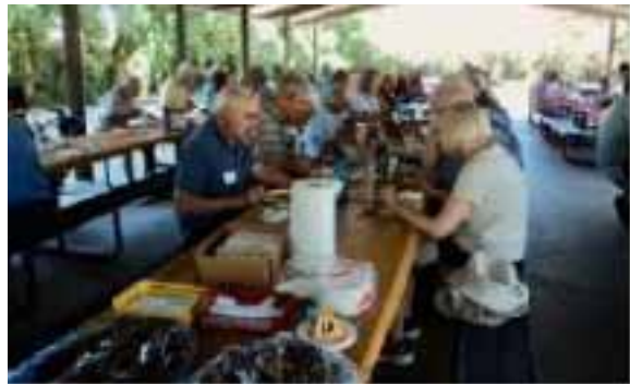
Above are some of the SIR Branch 23 members and their guests at the recent picnic.